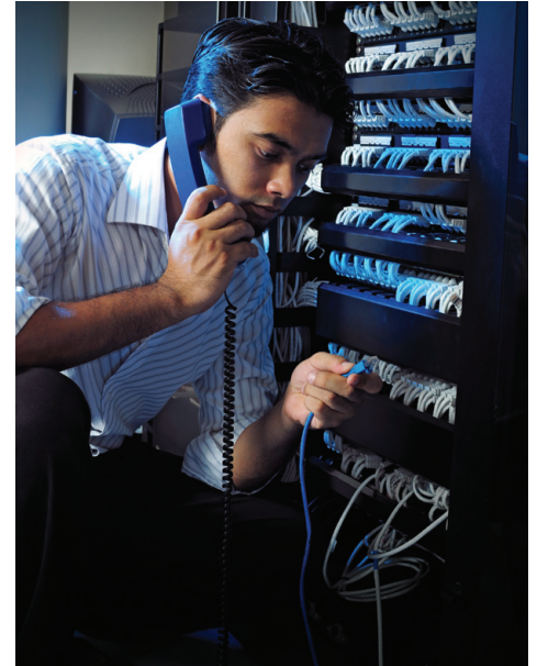
We're experts at developing and deploying secure, dependable IT systems, backed by superior support and services.