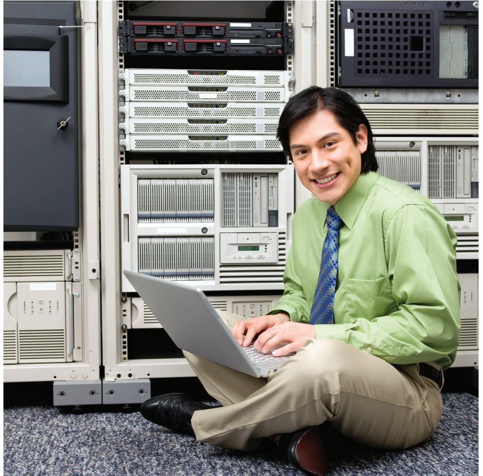
We maintain SAS70 Audit Type II accredited data centers to meet the highest standards of internal control. From server virtualization to high-availability SAN storage, PC Mall supports all of your advanced business technology needs.

Unlike other providers of MCS who are held back by restrictions or limitations on what they can provide, we can harness the full complement of PC Mall's service solutions to meet your business needs. For example, your business could deploy Exchange Server on-premises, host your mailboxes with Exchange Hosting Services, or combine these two options in a hybrid development.