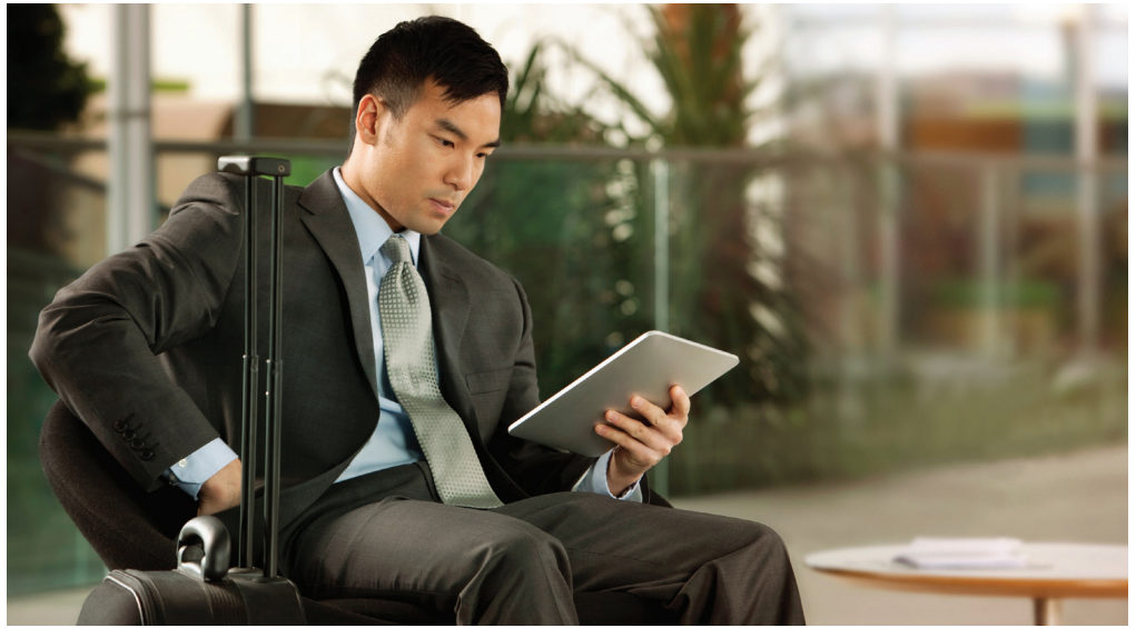
PCM's Be Mobile Jump Start Kit takes the guesswork out of integrating tablets into your organization.