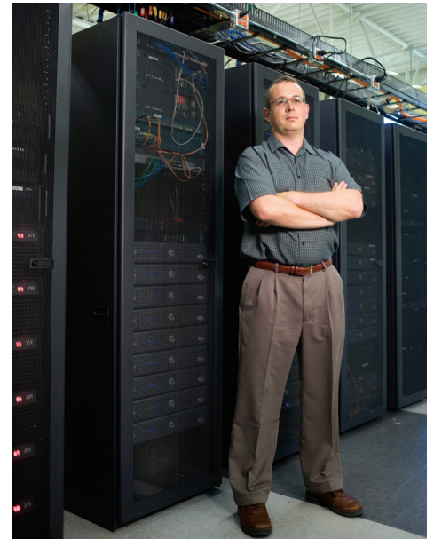
We're experts at developing and deploying secure, dependable IT systems, backed by superior support and services.